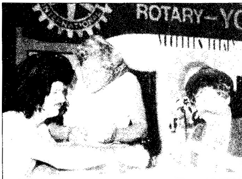
Voorhees Rotarians performing at one of their many Variety Shows. This one is at the 1989 District Conference in Atlantic City.